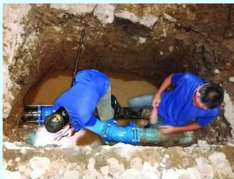
Pipeline interconnection works implemented by PrimeWater-Sorsogon City at corner Alegre and Burgos Sts., Brgy. Burabod and corner Rizal and Flores Sts., Brgy. Piot last September 3 and September 16, respectively.