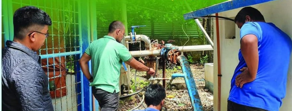
Water Sampling at Villa Alegre Pumping Station, September 5.

34% - COMPLIANCE TO CHLORINE RESIDUAL 91% - COMPLIANCE TO TURBIDITY 86% - COMPLIANCE TO MICROBIOLOGICAL QUALITY 12.80 PSI - AVERAGE SYSTEMS PRESSURE 47% - COMPLIANCE TO PRESSURE (AT LEAST 7.0 PSI)