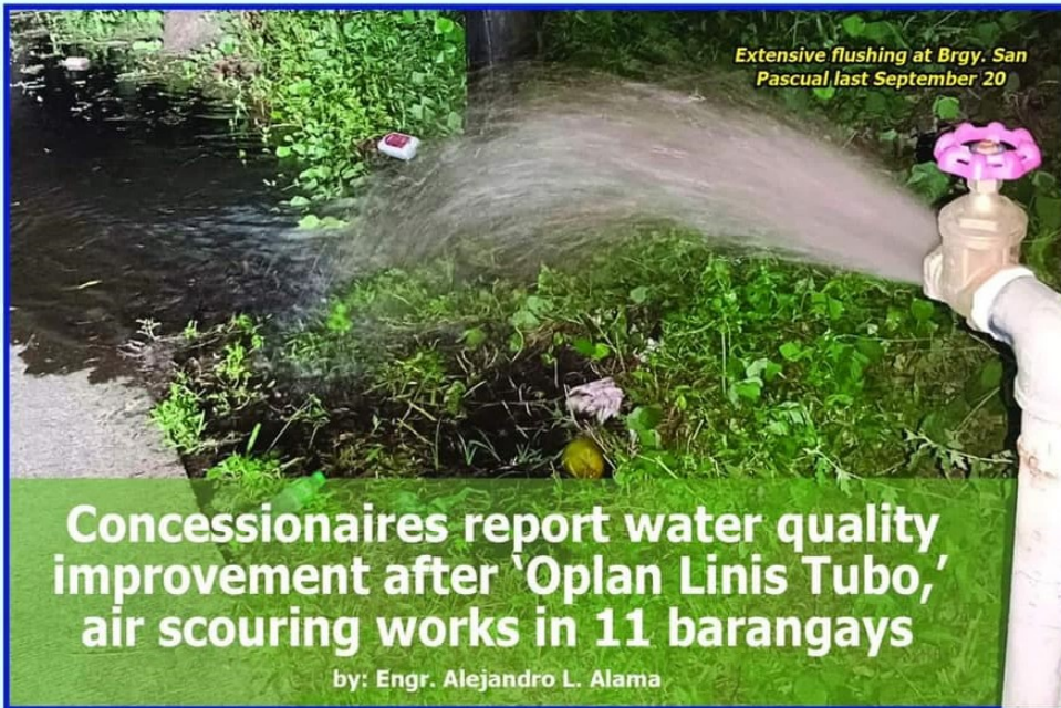
Extensive flushing at Brgy. San Pascual last September 20