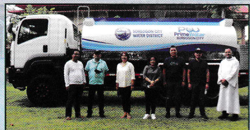
The SCWD Board of Directors and Management and PrimeWater-Sorsogon City Management during the water truck blessing last July 4.

During the troubleshooting of the Baribag deepwell on July 24-27, PrimeWater-Sorsogon